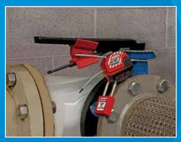
S3920 secure with S806 cable lockout device